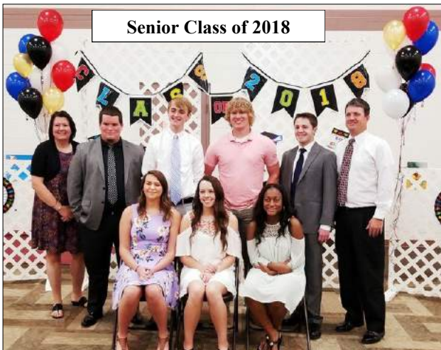
Senior Class of 2018