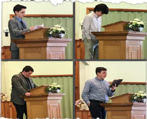
YOUNG MEN CONDUCTING SERVICES AT COBLE CHURCH OF CHRIST