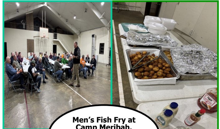
Men's Fish Fry at Camp Meribah. Well attended and enjoyed by all.