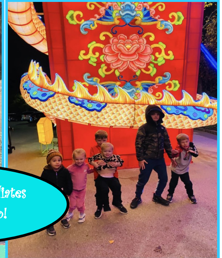
Sparks & Intermediates Trip To the Zoo!