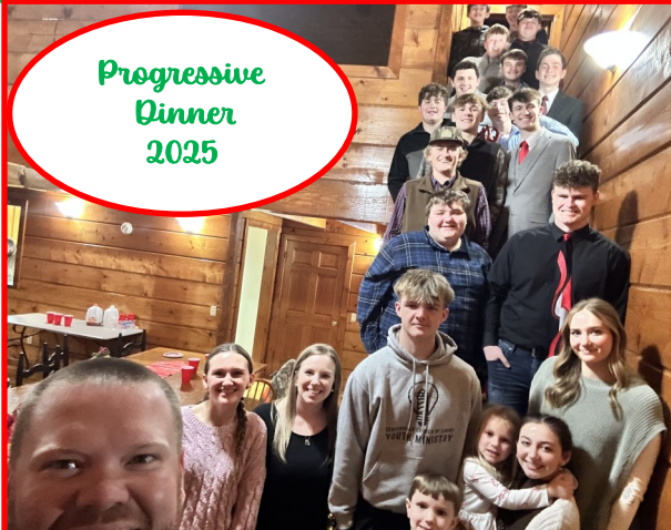
Progressive Dinner 2025