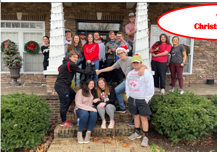
YAM Christmas Party