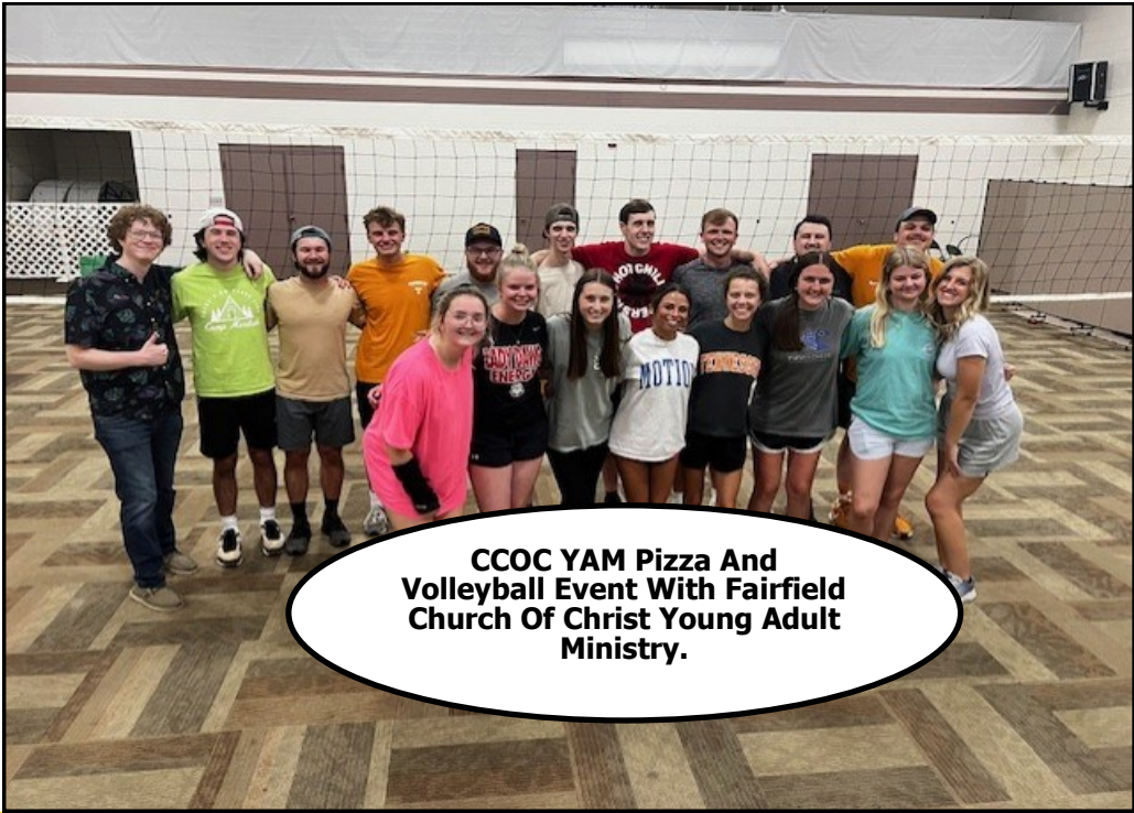
CCOC YAM Pizza And Volleyball Event With Fairfield Church Of Christ Young Adult Ministry.