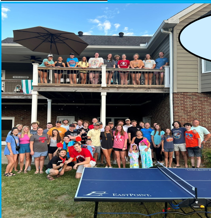
YAM SUMMER COOKOUT