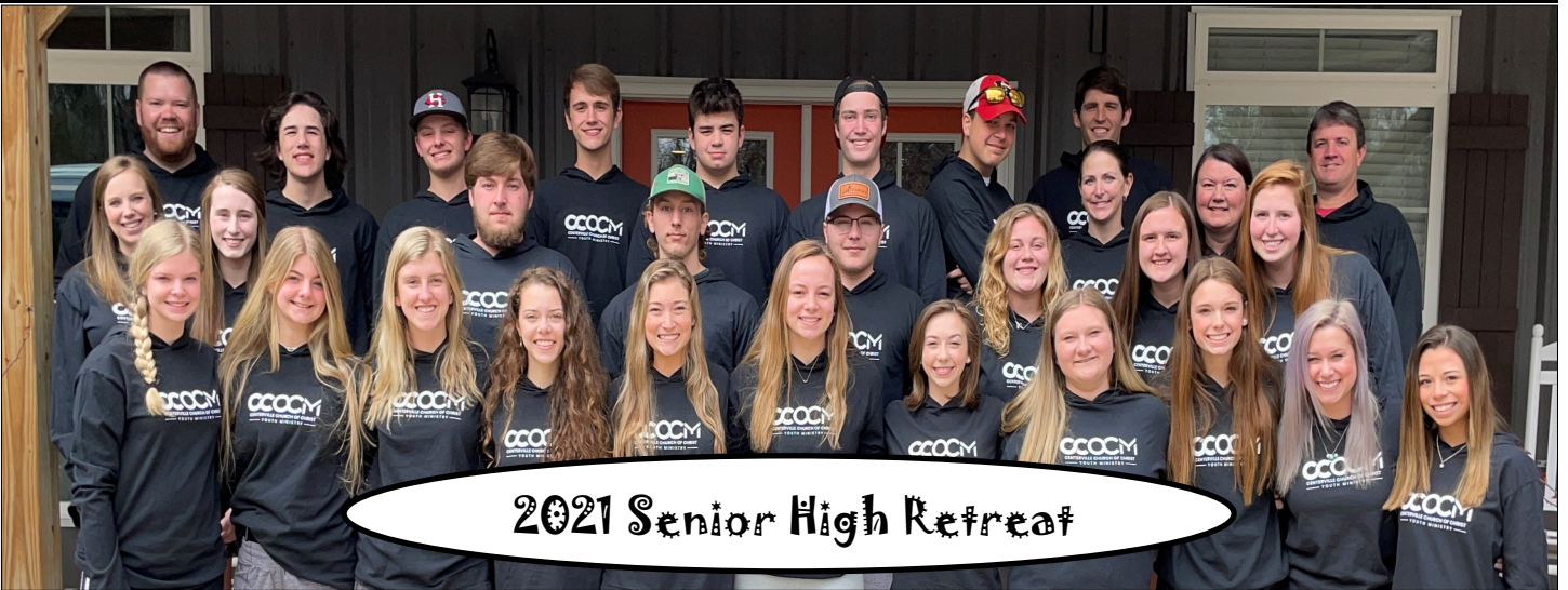
2021 Senior High Retreat

CENTERVILLE MESSENGER Free Upon Request-Published Weekly by Centerville Church of Christ, 138 N. Central Ave., Centerville, TN 37033-1427 March 10, 2021 Volume XXXXI -Number 9