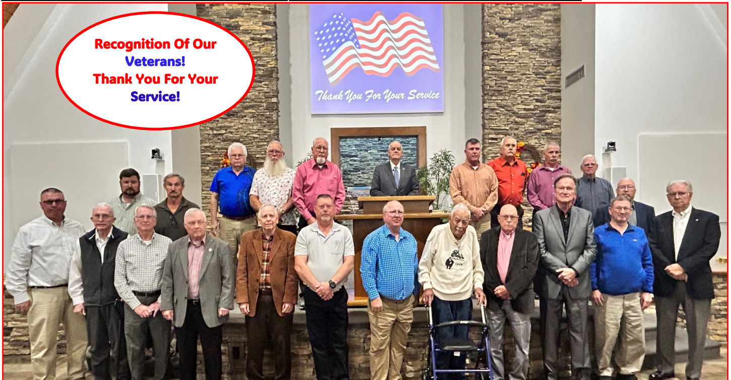
Recognition Of Our Veterans! Thank You For Your Service!