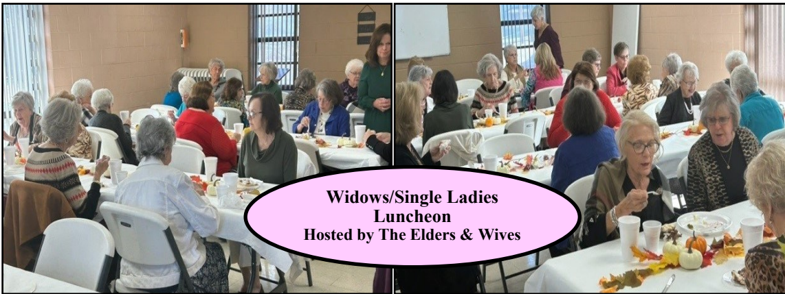
Widows/Single Ladies Luncheon Hosted by The Elders & Wives