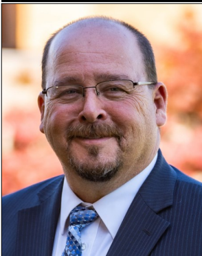
"From Where I Sit"

CENTERVILLE MESSENGER Free Upon Request-Published Weekly by Centerville Church of Christ, 138 N. Central Ave., Centerville, TN 37033-1427 November 15, 2023 Volume XXXXIII -Number 40