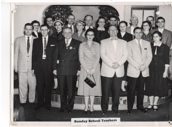
Sunday School Teachers