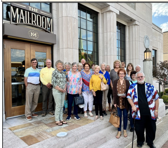
The Senior Group At The Mailroom In Clarksville, Tennessee