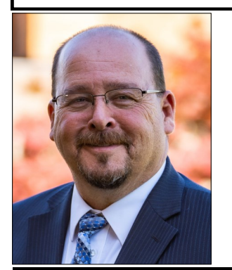
"From Where I Sit"

CENTERVILLE MESSENGER Free Upon Request-Published Weekly by Centerville Church of Christ, 138 N. Central Ave., Centerville, TN 37033-1427 September 7, 2022 Volume XXXXII –Number 34